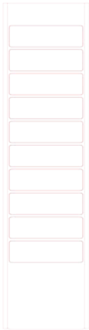
remoteLocker™ 110 10 locker pedestal