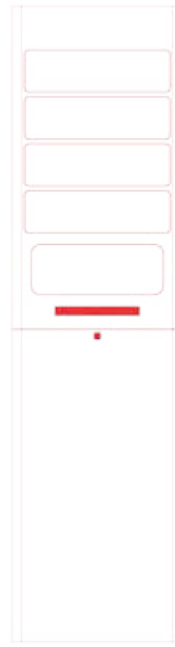
remoteLocker™ 105R 4 locker pedestal with return unit

*Minimum installation is 1 central unit and 2 additional pedestals.