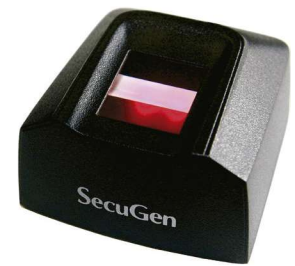
Hamster Pro 20